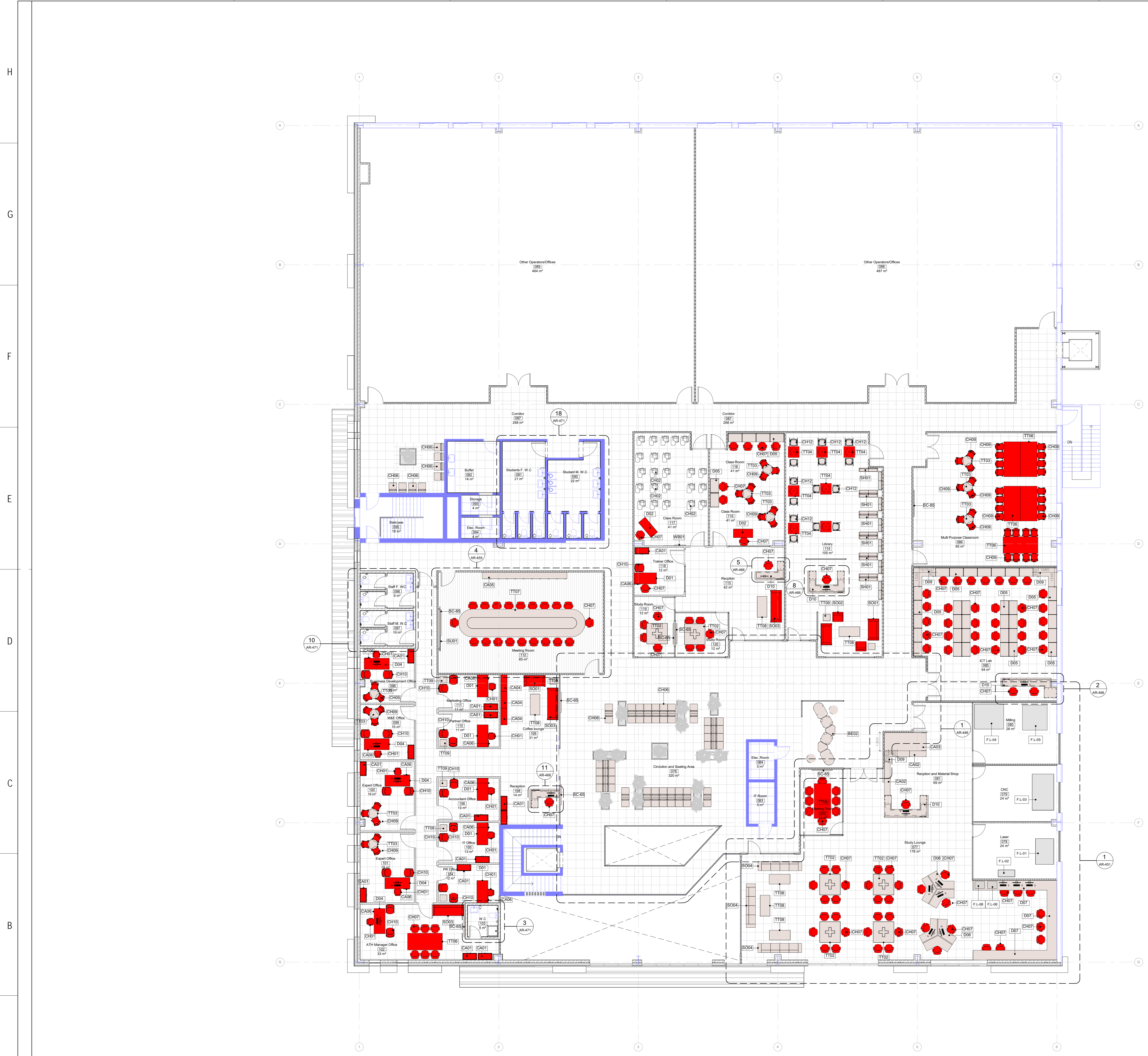
1 First Floor Level-Furniture Plan 1 : 100